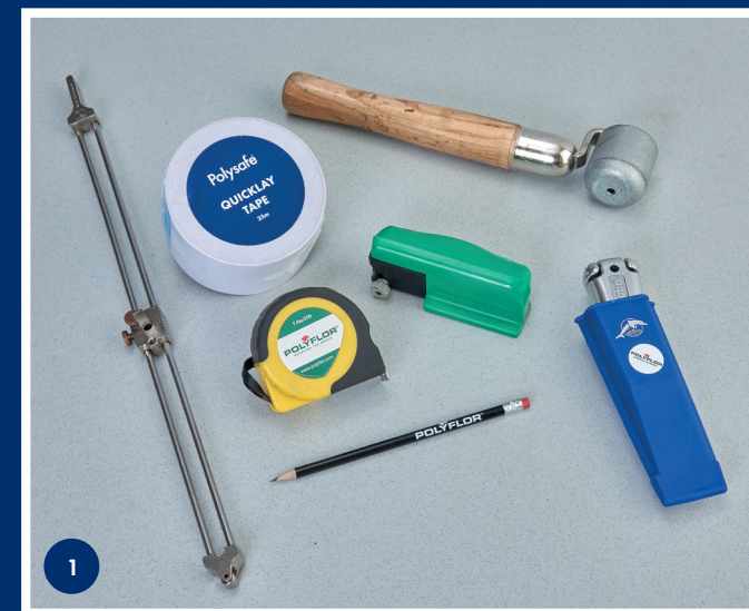
Figure 1 TOOLS REQUIRED