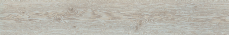
PLANED WHITE OAK 9783