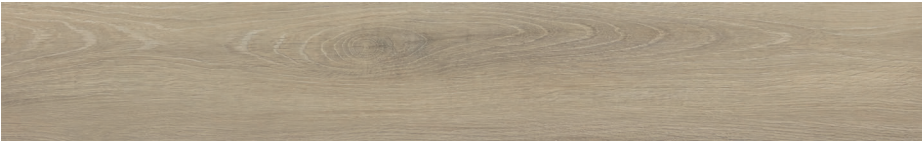
LONG BEACH OAK 9799