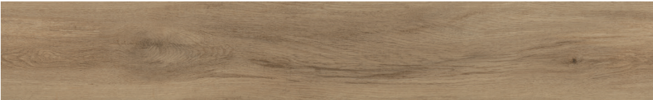
HARVEST OAK 9787