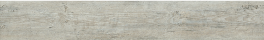
CRACKED WHITE OAK 9782