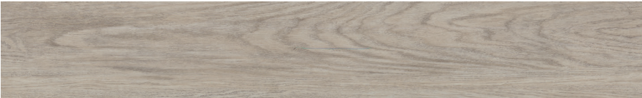
FRENCH LIMED OAK 9784