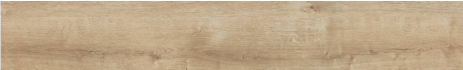
CHAMPAGNE OAK 9785