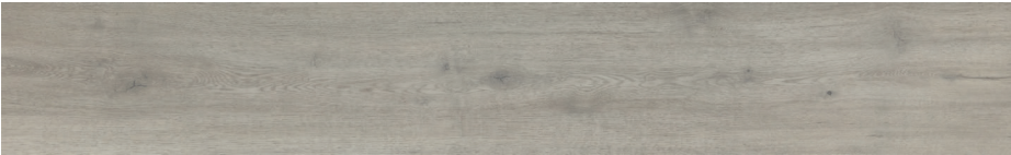
OYSTER BIRCH 9739