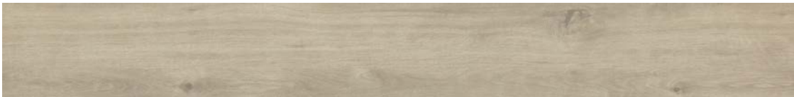
1099 WEATHERED BIRCH