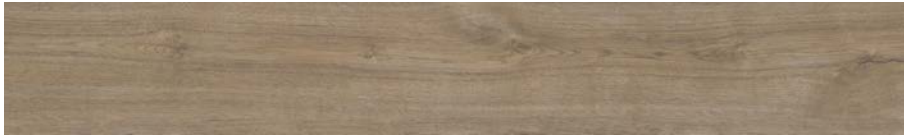
1097 RIVER OAK