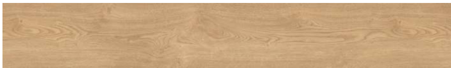
1098 FRENCH WASHED OAK