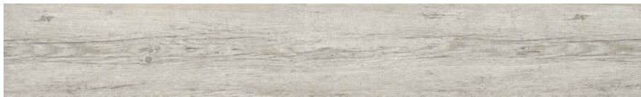
1041 COASTAL DRIFTWOOD