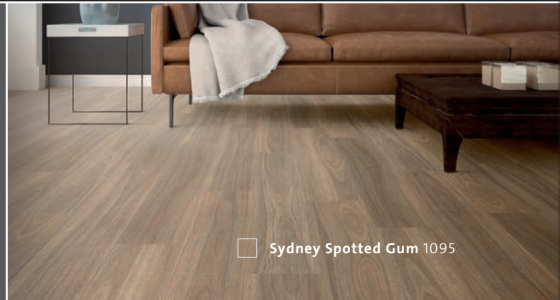
□ Sydney Spotted Gum 1095