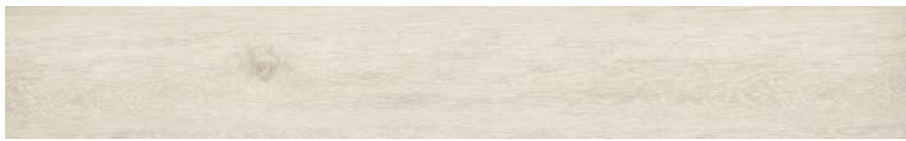
1039 WHITE OAK