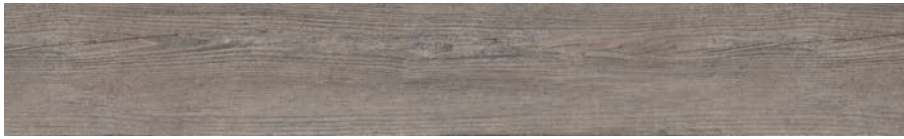
1053 FARMHOUSE GREY