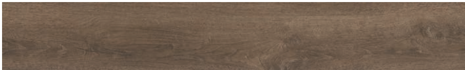
1054 RICH OAK