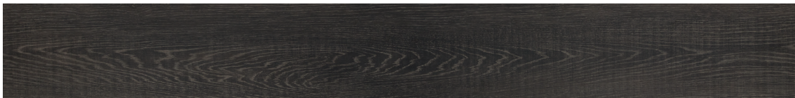
3554 BLACK CAVIAR