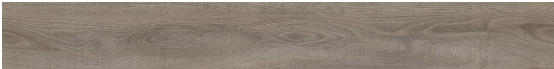
3510 QUEENSLAND DRIFTWOOD