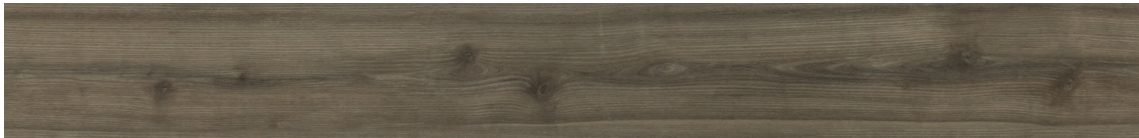
3617 MALVERN OAK