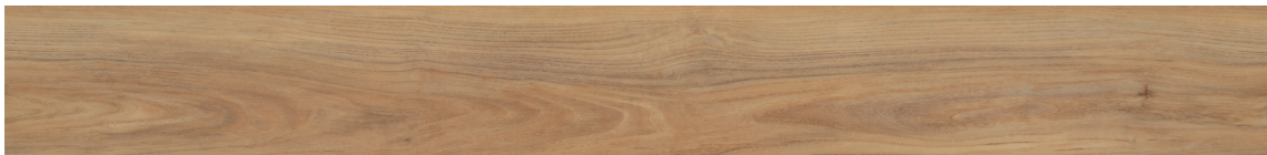
3550 TASMANIAN BLACKBUTT