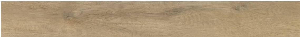
3616 BRUNSWICK OAK