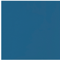
Blue 7512 w/r 7512 NCS S 5030-R90B LRV 15