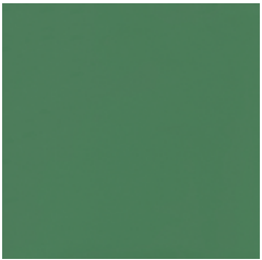
Green 7515 w/r 7515 NCS S 5030-G10Y LRV 18