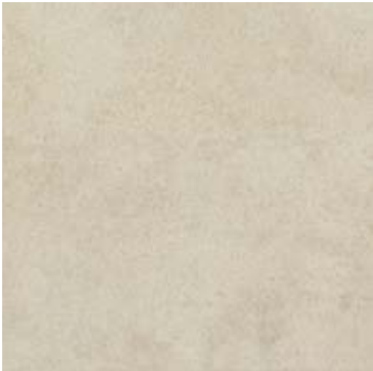
7500 PORTLAND STONE