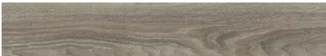
6506 LIGHT ELM