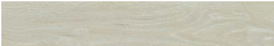
6505 WHITE OAK