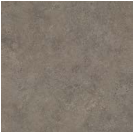
7504 WARM GREY CONCRETE