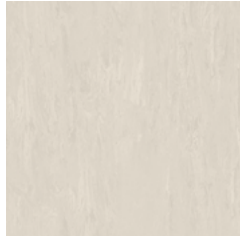
Nimbus Grey 2710 w/r 0630 NCS S 1505-Y60R LRV 70