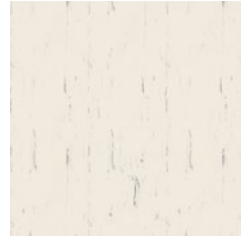
Dove White 2700 w/r 2700 NCS S 0603-Y40R LRV 72