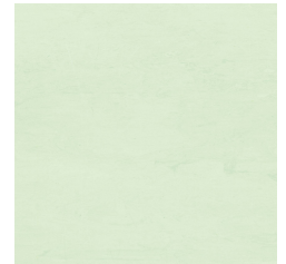
Spring Fern 2810 w/r 4420 LRV 64