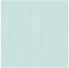
Summer Sky 2830 w/r 4430 NCS S 1510-B80G LRV 61