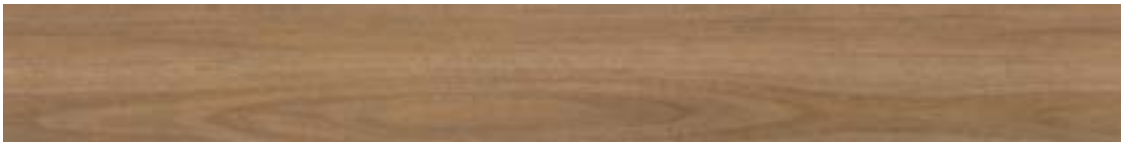
7078 JACARANDA BLACKBUTT